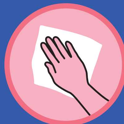
CLEAN SURFACES REGULARLY