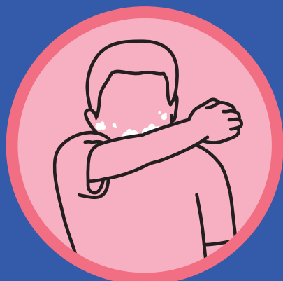
COUGH OR SNEEZE INTO YOUR ARM