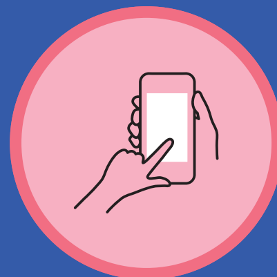
DOWNLOAD THE COVIDSAFE APP