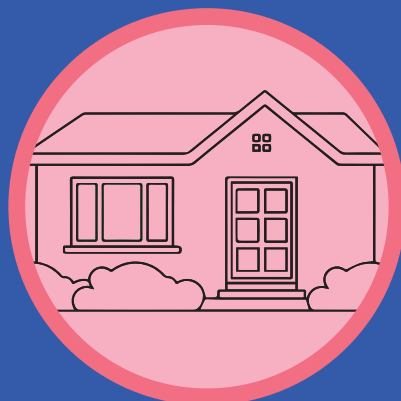
STAY HOME IF UNWELL AND GET TESTED