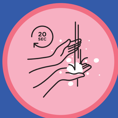
WASH HANDS REGULARLY WITH SOAP AND WATER